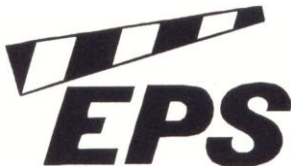
Model XP-2020N Express Exit Pay Station